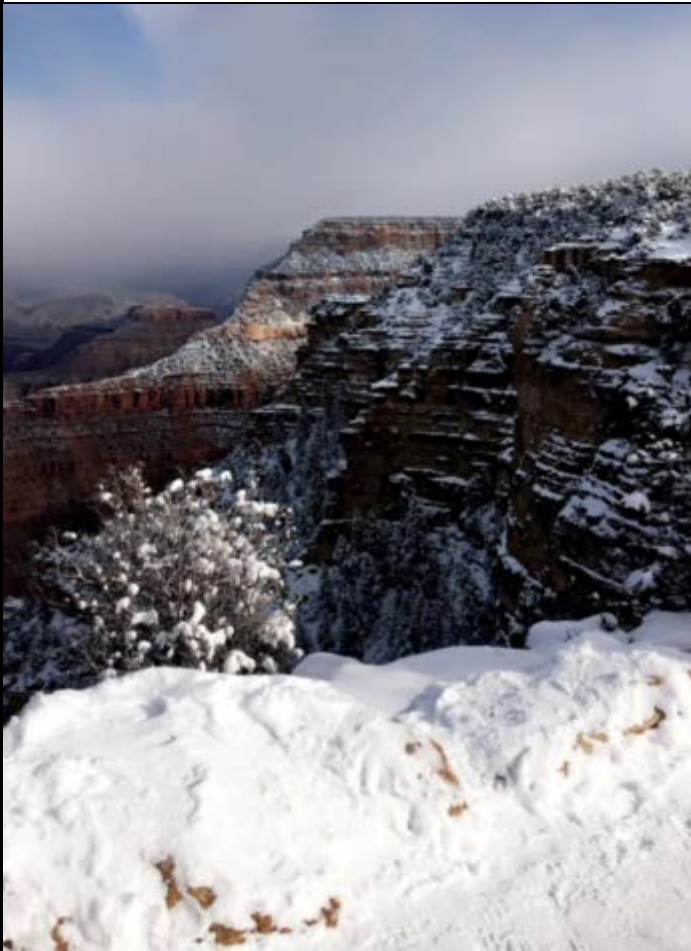
Grand Canyon (picture cropped) Venecia Venegas '27